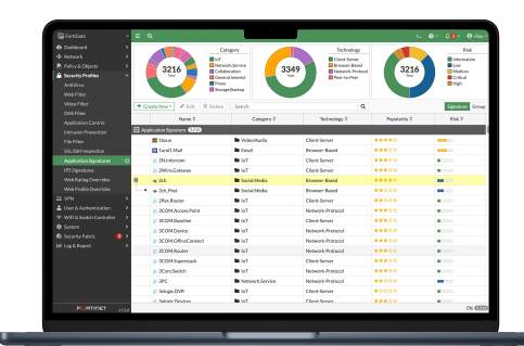
Visibility with FOS Application Signatures