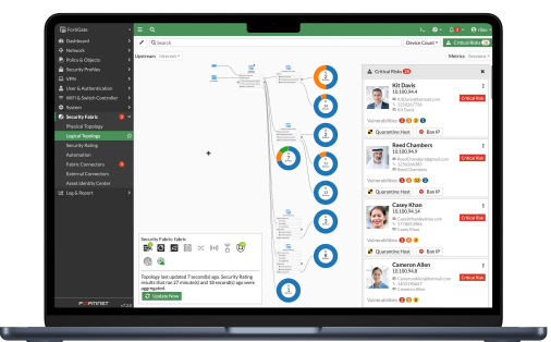
Intuitive easy to use view into the network and endpoint vulnerabilities